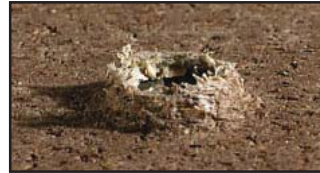
Standard Screw Causes 'mushrooming' of excess composite material