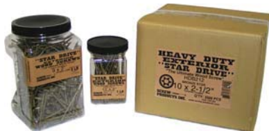
11lb & 5lb Plastic Jars with screw-on lids Bulk Cartons