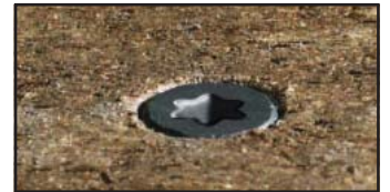
C-Deck Screw Specially-designed head and dual thread pull excess material into hole while countersinking